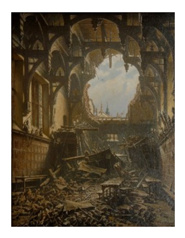
Following the explosion

caused an explosion which ripped a hole in the East gable, destroying the wall and smashing the minstrels' gallery and screen.