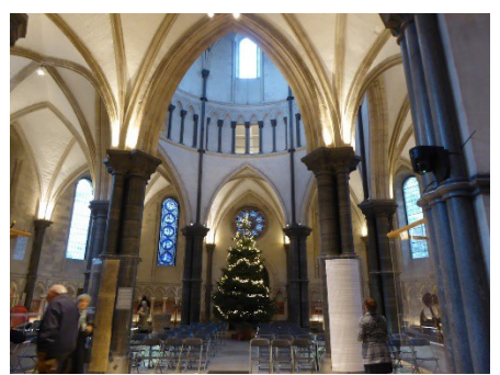
'Jerusalem' in the Temple Church

After the order of Knights Templar was dissolved, the Temple lands were officially transferred by the Pope to the Knights Hospitaller, who however had no use for the land themselves and began to let the property out. Henry VIII's reign spelled the end for the Knights Hospitaller in England, and their properties, including the Inn, passed to the Crown.