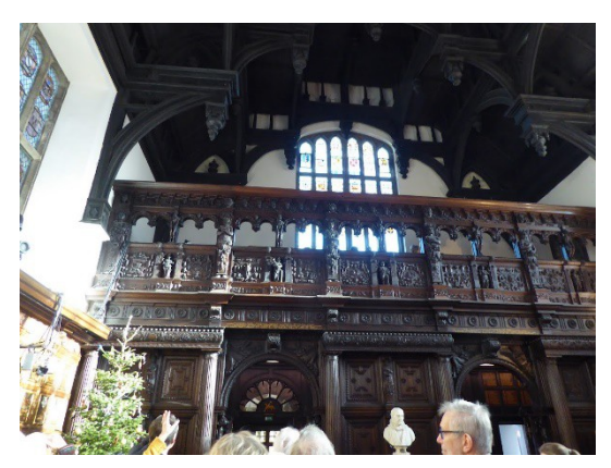
Restored minstrels' Gallery