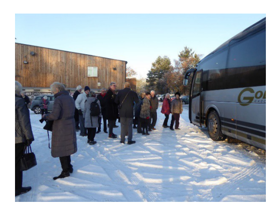
Arriving at the hall